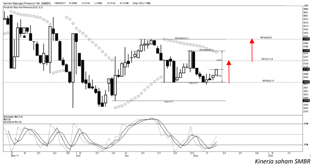
Kinerja saham SMBR

Danareksa research report are also available at Reuters Multex and First Call Direct and Bloomberg